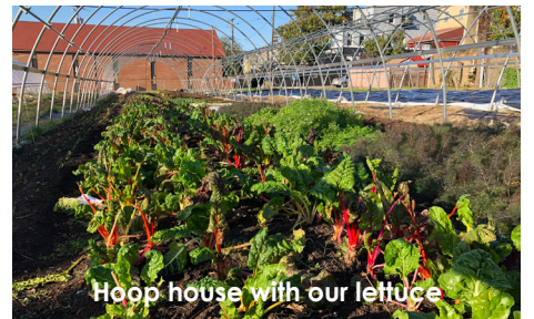
Hoop house with our lettuce