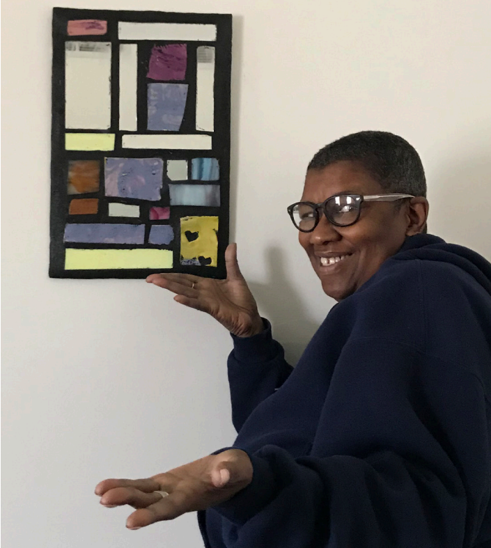
A resident shows off the mosaic art she created