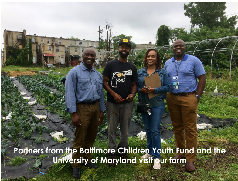
Partners from the Baltimore Children Youth Fund and the University of Maryland visit our farm

THRIVE, a workforce development program for young adults, was offered for the first time in 2019. Serving 15 young adults (ages 18-24), this 12-week program was offered first in the spring and again in the summer. In addition to hands-on farming or landscaping work, Thrive included a paid job-readiness program with adult education and soft-skills classes, certification classes in one of four career paths (business industry, hospitality, construction infrastructure, and warehouse logistics), internships, job shadowing, case management, counseling, service coordination, job placement, and 12 months of post case management upon the completion of the program. Of the 17 participants, 10 completed the program, 11 were placed in full-time employment, and seven were retained in their post-program positions. Thrive was supported by a generous grant of $100,000 from the Baltimore Children and Youth Fund.