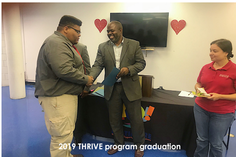
2019 THRIVE program graduation