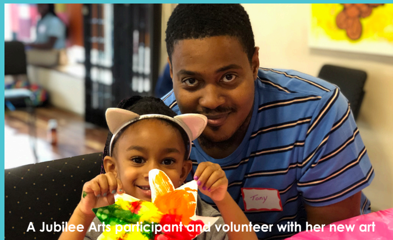
A Jubilee Arts participant and volunteer with her new art