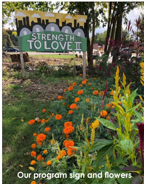
Our program sign and flowers