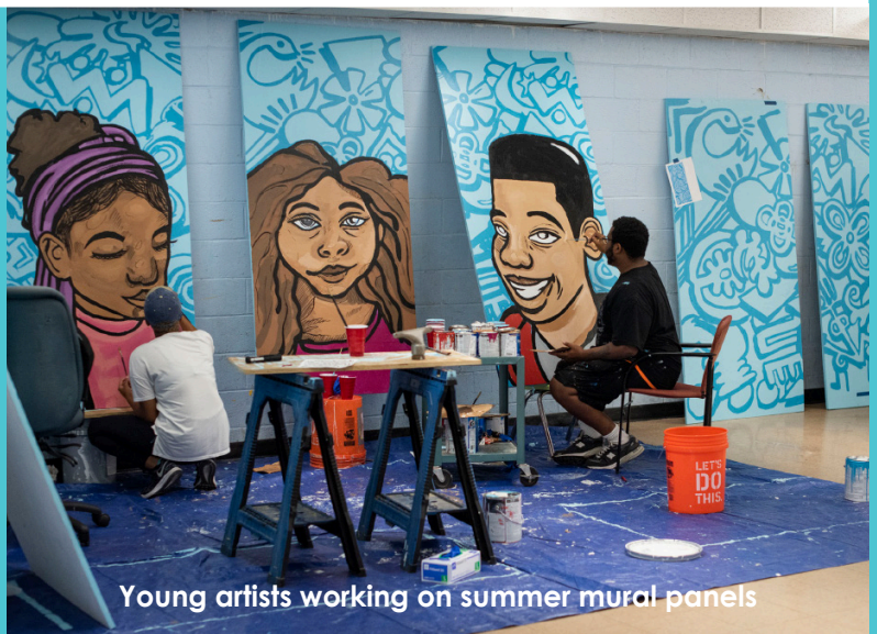
Young artists working on summer mural panels

The Art@Work program was launched in the summer of 2015 through a partnership between Jubilee Arts and The Baltimore Office of Promotion & The Arts. Art@Work is a five-week artist apprenticeship program employing Baltimore City youth enrolled in the YouthWorks program to create murals in their communities. By weaving together design thinking, workforce development, economic development, community organizing, and creative expression, Art@Work has empowered hundreds of youth ages 14-21 to contribute to their neighborhoods through art. In 2019, Art@Work: Sandtown employed 20 youth, two professional artists and four artist assistants , and engaged local, state, and national partners, while generating two new public artworks .