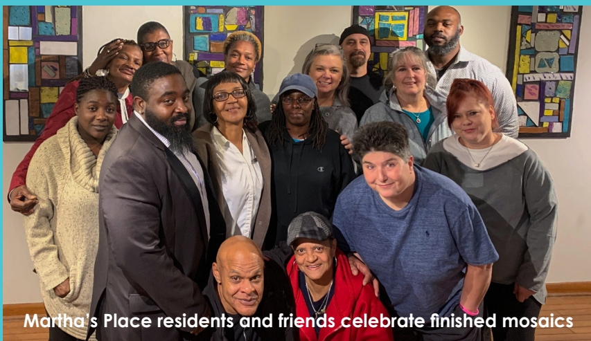
Martha's Place residents and friends celebrate finished mosaics

Martha's Place is a recovery program for women overcoming substance abuse and homelessness that also helps women achieve sobriety while maintaining a job and housing. The program offers housing with supportive care services such as addictions counseling, money management training, case management, wellness classes, and community meals for long-term support.