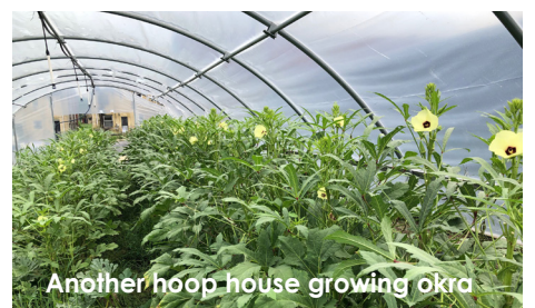
Another hoop-house growing okra