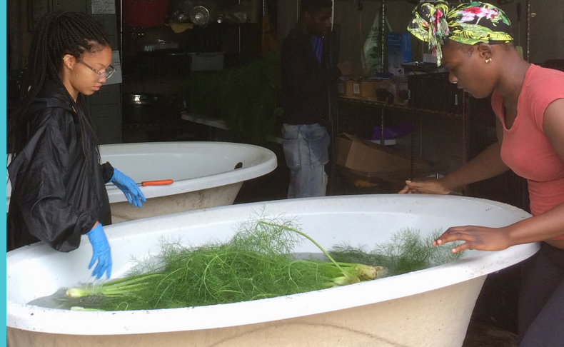
Strength to Love II volunteers rinsing harvested produce