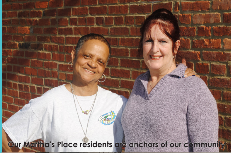
Our Martha's Place residents are anchors of our community

The three largest pieces are on display in the dining/group meeting room.