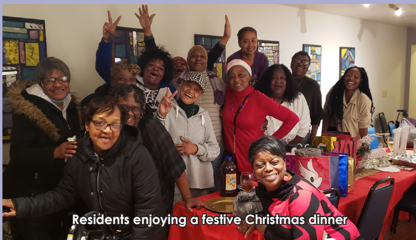
Residents enjoying a festive Christmas dinner

Martha's Place provides housing and recovery services for women overcoming addiction and homelessness at a semi-independent level — we are long-term housing so there is no time limit as to how long the women can stay, but the ultimate goal is for them to find their own place and live fully independently after graduating from our program. We provide supplemental services, such as addictions counseling, case management, money management, and social events. Recovery is always our number one priority.