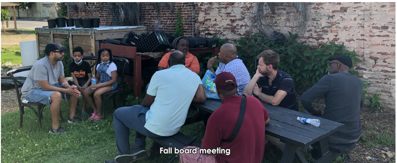
Fall board meeting