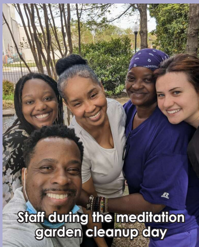
Staff during the meditation garden cleanup day

2022 was also a year of fun! In-person activities returned with full force, including a Martha's Place movie night, the ladies visited the Baltimore Aquarium, DC Zoo, participated in multiple community clean up days, Baltimore City Overdose Awareness Day, the annual NA Convention, and Thanksgiving and Christmas dinners.