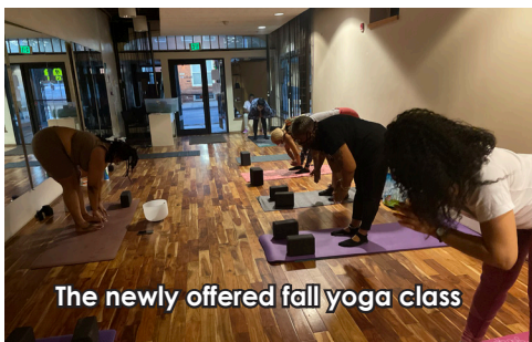
The newly offered fall yoga class