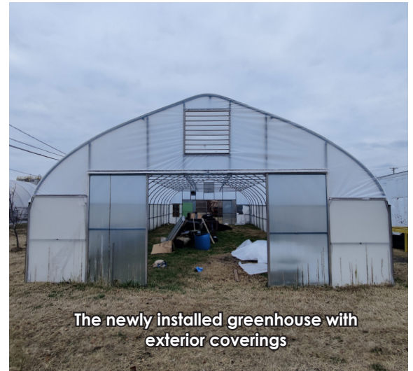
The newly installed greenhouse with exterior coverings

In 2022, Strength to Love II also made headway on several exciting capital improvements and projects to our farm that included: