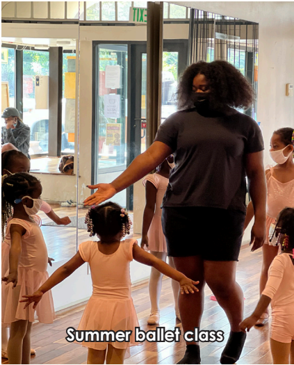
Summer ballet class

Jubilee Arts is a community program providing arts classes to the residents of the Sandtown-Winchester, Upton, and surrounding neighborhoods in west Baltimore. The program is located on Pennsylvania Avenue, an area with a rich history of African-American culture. Jubilee Arts uses art as a tool to build community, learn about our history, and change our future. We offer programming in dance, visual arts, business, and ceramics in partnership with the Maryland Institute College of Art, area artists, and dancers.