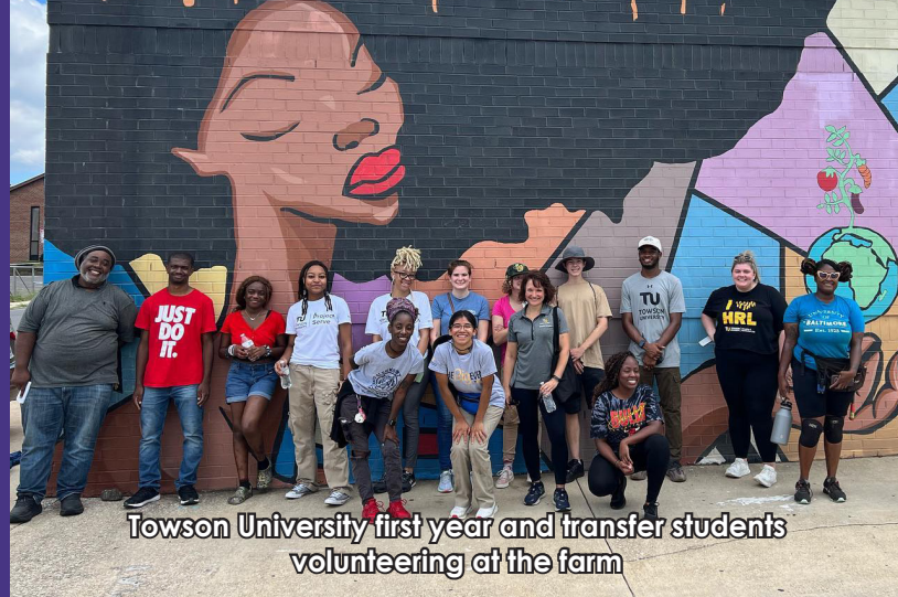
Towson University first year and transfer students volunteering at the farm