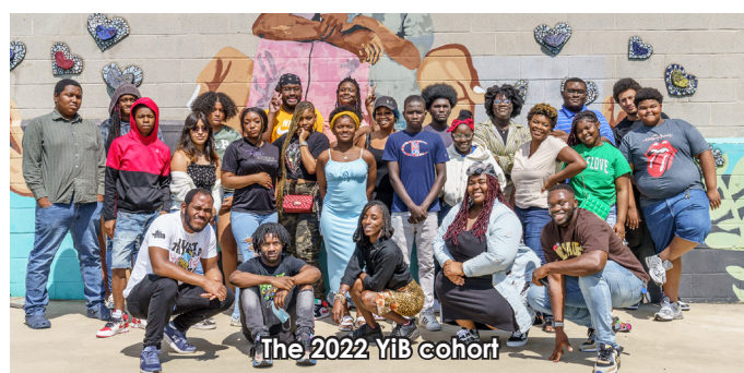
The 2022 YiB cohort