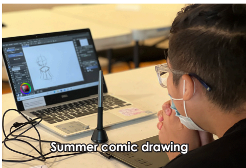
Summer comic drawing

Party, and completed a mural for the Robert C. Marshall Community Center. 2022 was a busy but fulfilling year encouraging creativity, growth, and community in artists of all ages throughout west Baltimore!