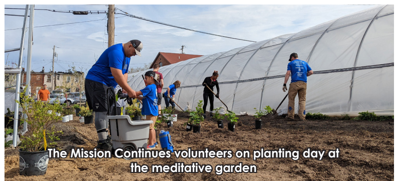
The Mission Continues volunteers on planting day at the meditative garden