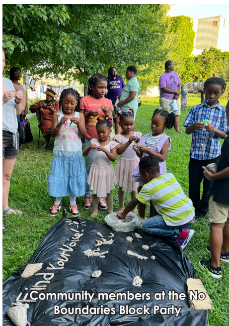
Community members at the No Boundaries Block Party