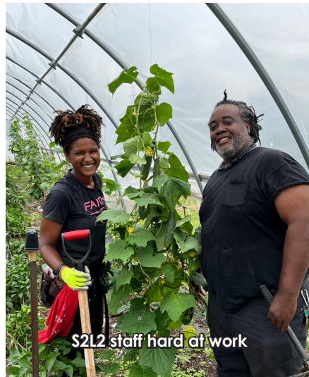
S2L2 staff hard at work

2022 was a year of progress: this year, we collaborated with The Mission Continues in order to make considerable progress on our new meditative garden as well as installing fencing around our main growing areas. This was also the first year of developing Strength to Love II's new Urban Youth in Agriculture Program (UYAP), which would replace the past THRIVE Workforce Development program. Finally, 2022 was the first year of the Strength to Love II Farmers Market, which opened in the summer.