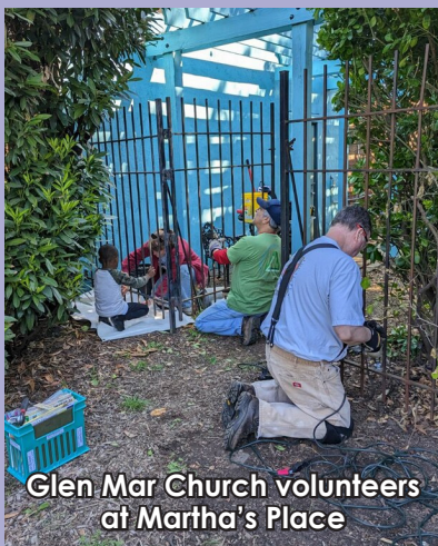
Glen Mar Church volunteers at Martha's Place